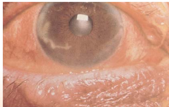
Conjunctivitis with a dendritic corneal ulceration due to HSV. Taken from: Margileth A, Atlas of Infectious Diseases: Upper Respiratory and Head and Neck Infections, Edited by Gerald Mandell (series editor), Itzhak Brook. Philadelphia, Current Medicine Group LLC, ©2000.

Endotheliitis is characterized by keratic precipitates (KP), overlying stromal and epithelial edema, and absence of stroma infiltrate or neovascularization. 3 While it has been primarily considered an immunologic reaction to an antigen in endothelial cells, speculation exists regarding the role of a live virus. 3 Endotheliitis may occur several months to years following an episode of infectious keratitis. 11 According to the Jabs study, intraocular inflammation involvement (iritis or uveitis) occurred in 4 % of ocular herpetic disease episodes. 1